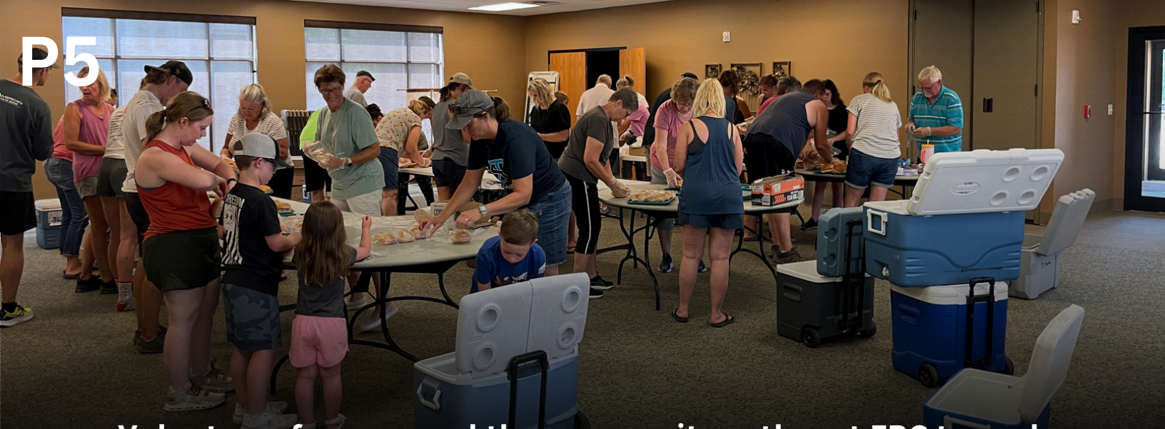
Volunteers from around the community gather at FRC to pack sandwiches for clean up crews in Rock Valley. Over 50 helped assemble 1,200+ buns with donated meat in under 50 minutes!